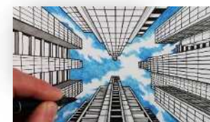
Bottom to Top

There are three types of perspectives but we will be learning how to draw eye-level perspective .